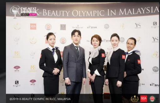
SISA UNITED Uniform (ADDITIONAL)