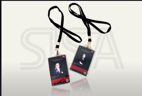
Chairman Photo card