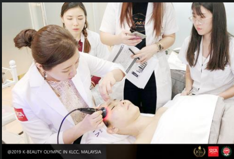
SISA UNITED Gown (ADDITIONAL)