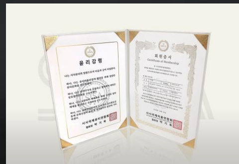
SISA UNITED Member Certificate