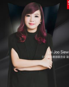
鹿兰社 SISA国际美容联合会 副会长